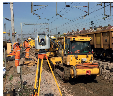
▲ The Trimble SX10 was used for Progressive Assurance

created a front offset file on the tablet and then transferred it to the tamper via a USB after every cord so that at no point was the