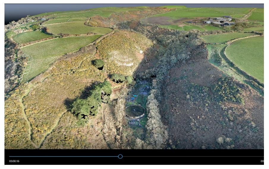
A flythrough was included in the final deliverable