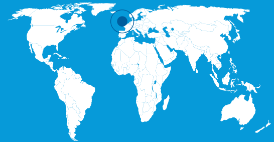
Location UNITED KINGDOM

As the largest road project under construction in the U.K., England's £1.5 billion upgrade and expansion of the A14 highway will modernize 34 km of road between Cambridge and Huntingdon. The A14 Integrated Delivery Team, a joint venture between Costain, Skanska, Balfour Beatty and Atkins Jacobs, has applied new approaches in sharing project information with the workforce, residents and landowners affected by the work.