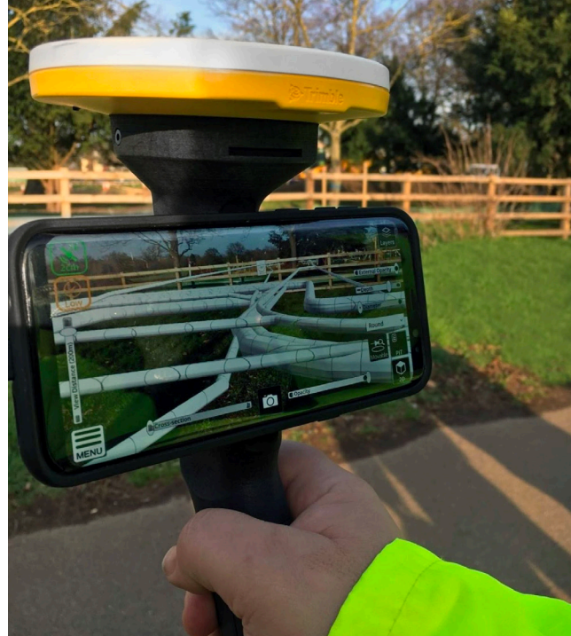
Trimble SiteVision displays a 3D model of underground utilities with live view of the existing features.

"My goal is to connect decision makers with accurate information. I see Trimble SiteVision as a way of providing information that any user can understand."