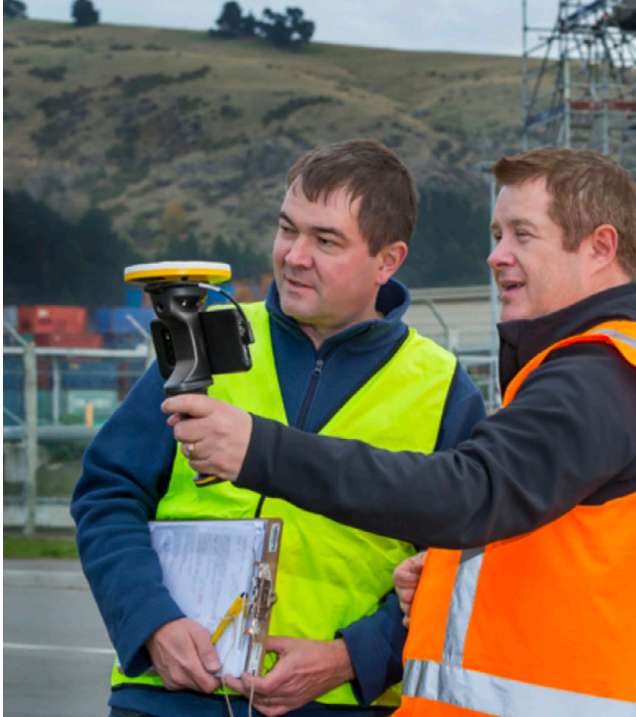
Trimble SiteVision's small size and easy operation enables professional and non-technical personnel to use in-field, real-time augmented reality.