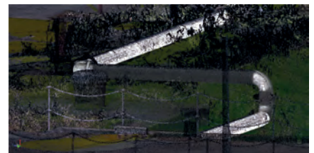
▲ Modelled pipe work

It was TBC to the rescue again when a hiccup in communications meant that the model was created to non-georeferenced coordinates, something that couldn't be easily rectified in its modelling package,